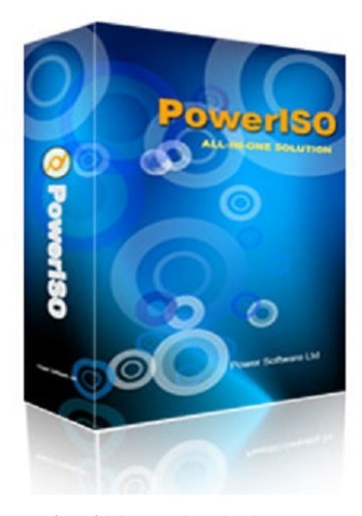
power iso with keygen download

PowerISO 7.8 Crack is the latest virtual disk image driver software. This tool is easy-to-use and has a variety of powerful features.. Product Title Huffy Oxide 24-inch Boys Mountain Bike for Men, Blue Average Rating: ... Dual Suspension Frame and Suspension Fork, Black 4.2 out of 5 stars 36 TOUGH ... pedal power for strong acceleration on straight surfaces and uphill climbs. ... Trail Bike, 26 inch, 27.5 inch, Satin Tropic Blue, Model Number: 76908.